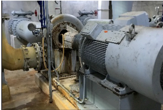
ITT 12 x 12 x 15 NSY End Suction Pump

Wastewater plants often have large equipment to move the fluids needed for normal operation. Repairing this large equipment is very costly and time consuming. A wastewater treatment plant that Chesterton works with in Ohio is a prime example. They have large end suction pumps using cartridge seals that need to be replaced every two years or less. It takes the maintenance crew approx. 8–10 hours to disassemble the pump, replace the cartridge seal, and reinstall the pump.