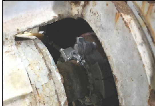
442C Seal 114 mm (4.50") was installed in less than two hours

When presented with the advantages of the Chesterton 442C Cartridge Split Seal and the ease of installation and use, the customer decided to replace a cartridge seal on one of the pumps in the plant. A 442C seal 4.50" with RSC/RSC faces and FEPM O-Rings was installed by the plant maintenance crew and took about 1–2 hours to complete. The seal has now been running without issues for over 5 months. Some of the prior cartridge seals lasted only 4–5 months!