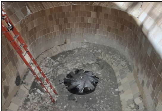
Top view of re-pulper "pit" where defective paper is ground by the blades.

To increase the length of continuous service to support plant cycle and improve safety.