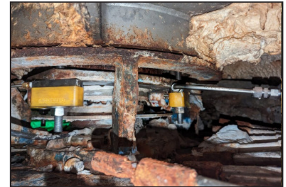
Equipment with AMPS technology installed on all four bolts.

The customer is very happy with the results and is looking to install AMPS technology on another re-pulper.