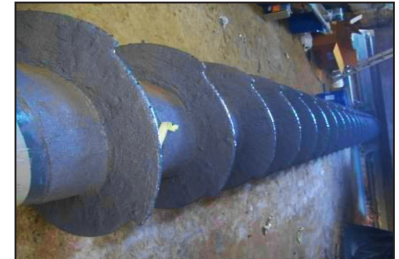
Repaired transport screw