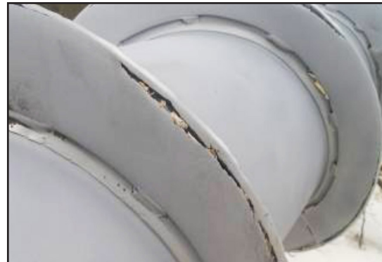
Cleaned and blasted surface

*ARC BX2 is the "Bulk" package size of ARC 897